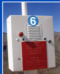
Radio Transmission Equipment